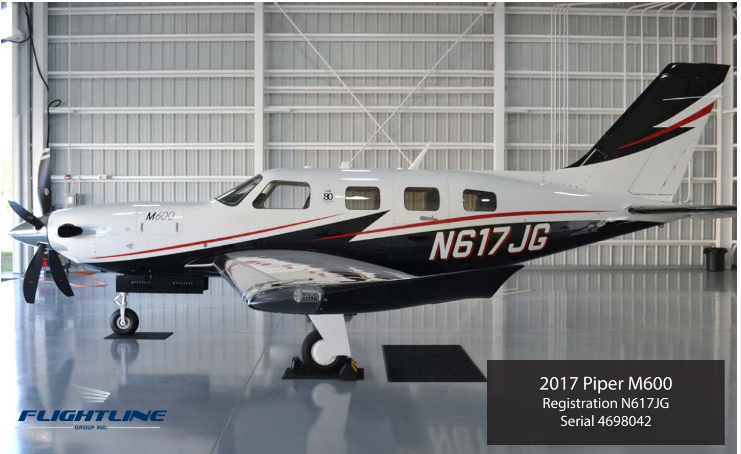
2017 Piper M600 Registration N617JG Serial 4698042